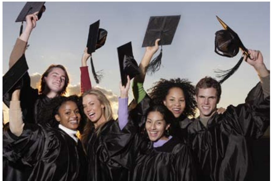
Not quite the way it really is.

Many of my black students would repeat themselves over and over again—just louder. It was as if they suffered